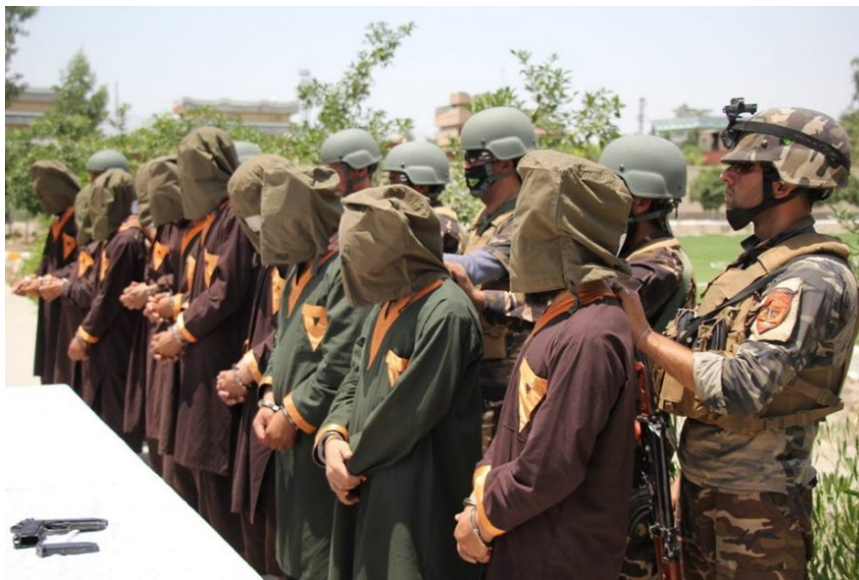
(Militants arrested from Kandahar )

Irrespective of whether Farooqi was arrested or surrendered, arrests of two other persons along with him signify how the IS-KP, in spite of its operational limitations, might have emerged as a melting pot for other terrorists of varying aspirations in South Asia, to join or align themselves with the IS-KP as members or affiliates.