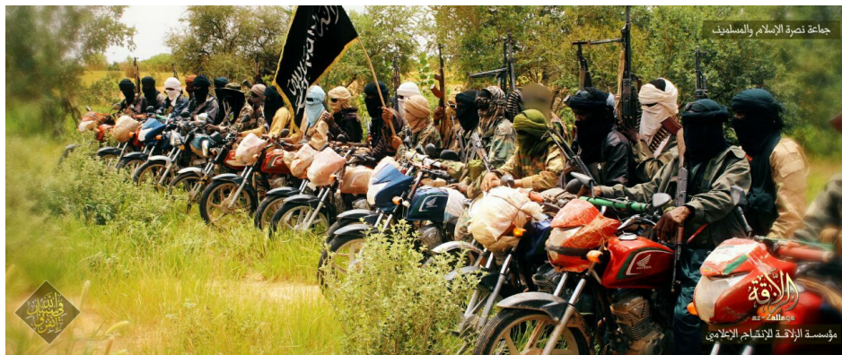
(In February 2020, the JNIM released three sets of photos highlighting its recruitment campaign titled, "Go forth in the cause of Allah" )

Rising extreme inequality, despite impressive economic growth in the past two decades, feeds insurgencies in the region. Nearly 70 per cent of West Africa's population depends on agriculture and livestock for a living. That way of life continues to be threatened by persistent droughts. As a result, a lot of young men have found a career in terrorism. The combination of poverty, weak state presence and under-resourced armies has allowed jihadist groups, criminal networks and ethnic armed groups to thrive in the region, despite regional and international efforts.