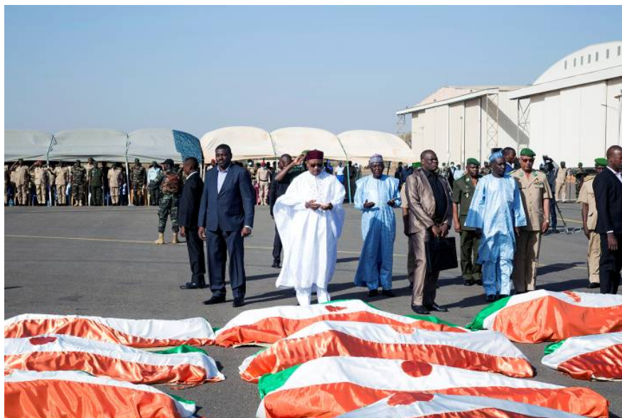
(Flag draped body of soldiers killed during a Jihadist attack in display in Niger in December 2019. )

On 1 February 2020, unidentified heavily armed men on motorbikes arrived in Lamdamol village in Seno province of Burkina Faso, north of the capital Ouagadougou and massacred 20 civilians . 1 The attack took place a week after a similar carnage in the province of Soum. Suspected Islamist terrorists had rounded up the villagers, executed the men and asked the women to leave the village. In early January, 36 people had been massacred at two villages in the northern Sanmatenga province. Jihadists also kidnapped and killed a Canadian mine worker and abducted two other humanitarian workers in December 2019. These incidents are the latest in a series of attacks that have taken place in this West African nation. A day before the 27 January attack, the prime minister of Burkina Faso and cabinet had resigned taking responsibility for the slide in security situation.